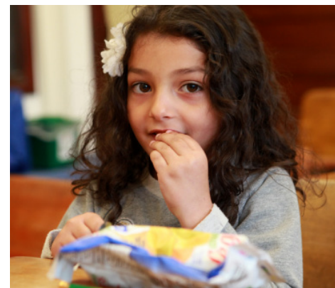
Students are agents of change in their city