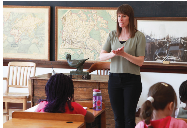
Students work in the historic classroom

These weekly newsletters also create a space for teachers and the coordinator to communicate and celebrate the work before, during and after a week at 2School. As such, this report aims to offer insight into how a week at 2School was embedded into a year of learning in the 2018– 2019 school year, highlighting our many partners.