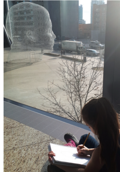
A student in reflection

Your support has made a difference. 2School is fortunate to have the continued support of the CBE Board of Trustees, the CCSD Board of Trustees, CBE and CCSD superintendents, as well as many CBE employees who welcome students to their workplace.