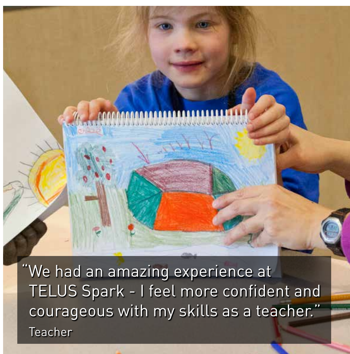
"We had an amazing experience at TELUS Spark - I feel more confident and courageous with my skills as a teacher." Teacher