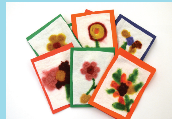
Handcrafted cards remind the SPRY seniors of time spent with their new student friends.