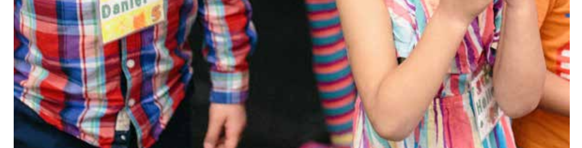
"The Jubilee Auditorium adds value to our Community because it brings people together." Grade 6 Student