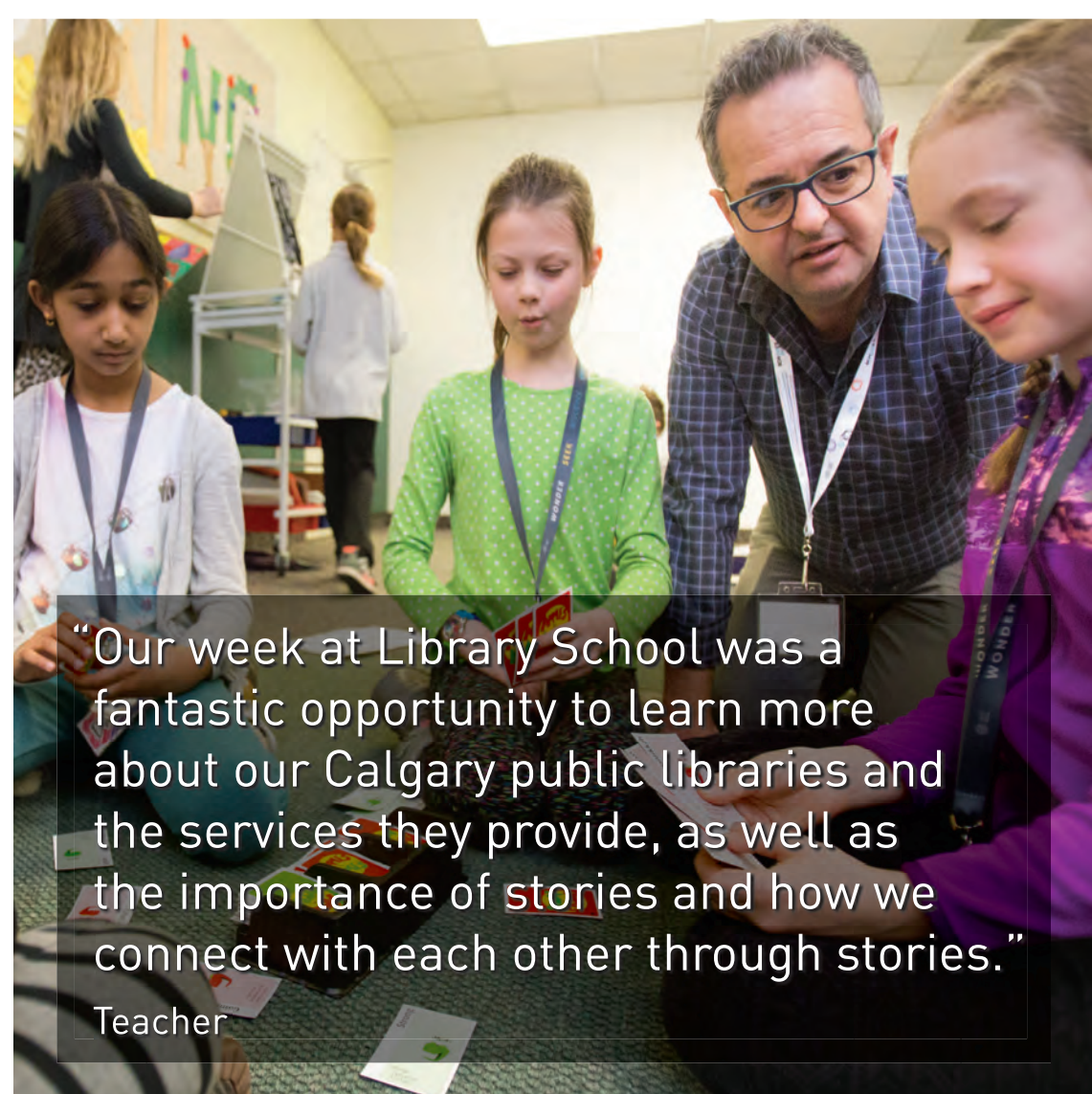
"Our week at Library School was a fantastic opportunity to learn more about our Calgary public libraries and the services they provide, as well as the importance of stories and how we connect with each other through stories." Teacher