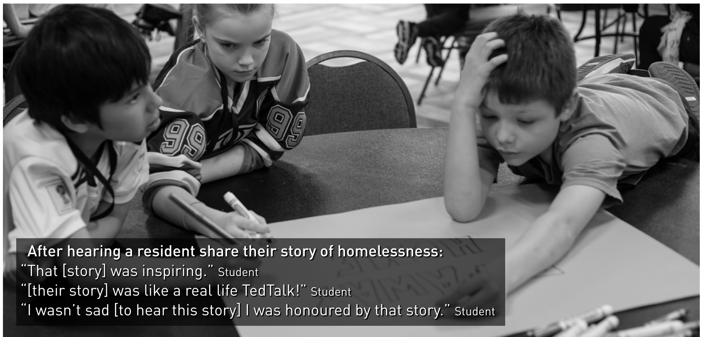
After hearing a resident share their story of homelessness: "That [story] was inspiring." Student "[their story] was like a real life TedTalk!" Student "I wasn't sad [to hear this story] I was honoured by that story." Student