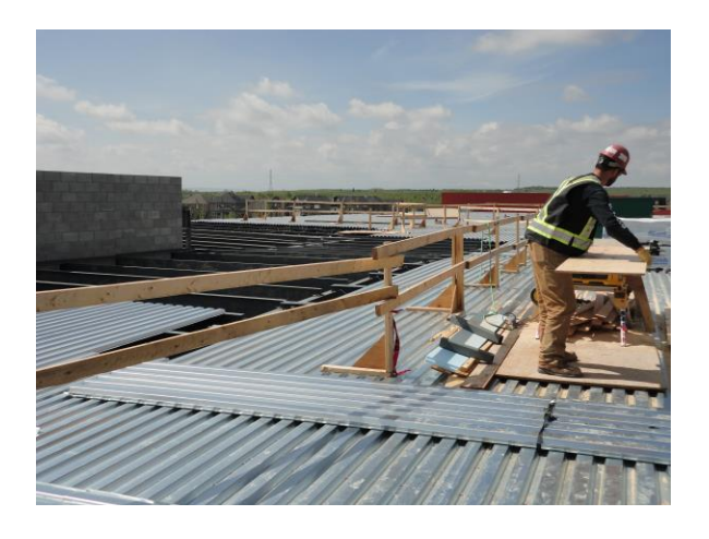
Upper Hallway Gathering Area #1