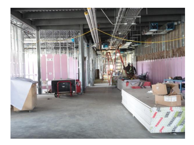
Upper Hallway Gathering Area #2