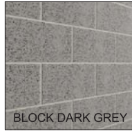
BLOCK DARK GREY