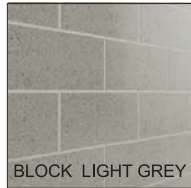
BLOCK LIGHT GREY